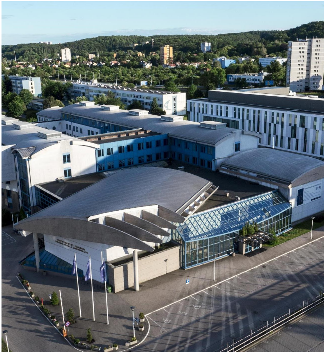
Faculty of Law & Administration