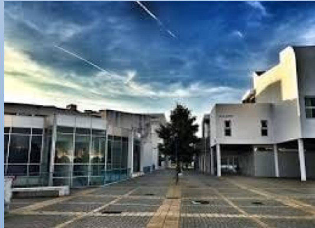
JEREZ DE LA FRONTERA