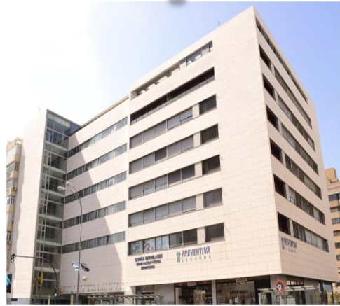
Facultad de Enfermería y Fisioterapia