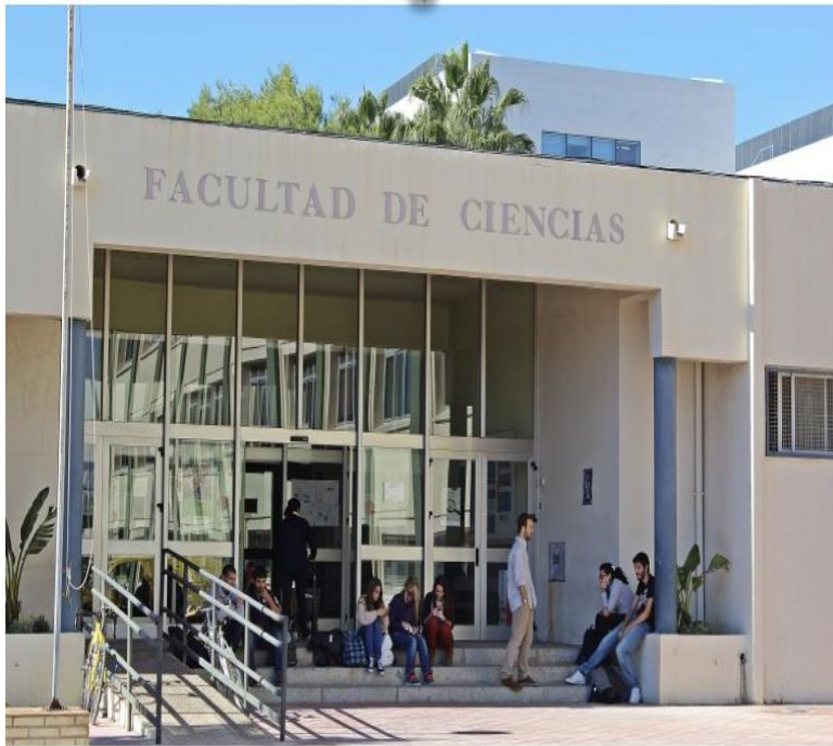
Facultad de Ciencias