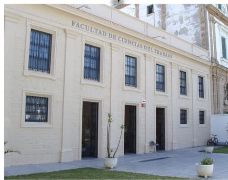
Facultad de Ciencias del Trabajo