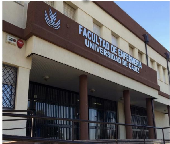
Facultad de Enfermería