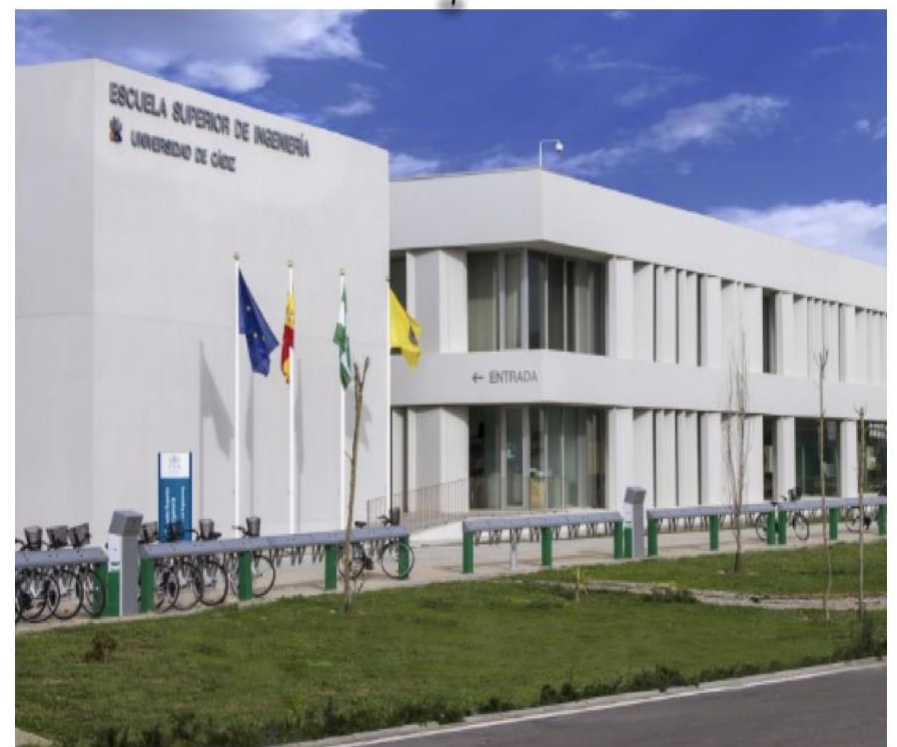
Escuela Superior de Ingeniería