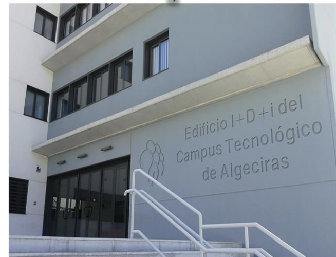
Sede Algeciras Facultad de Derecho