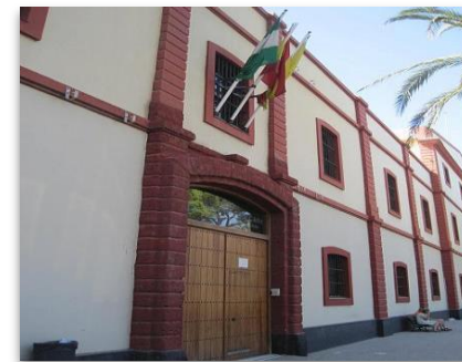
Facultad de Filosofía y Letras