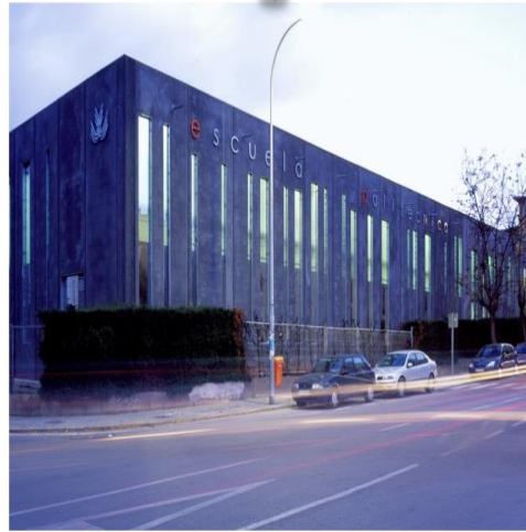
Escuela Politécnica Superior