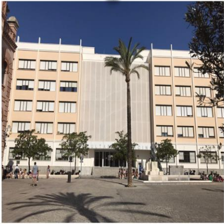
Facultad de Medicina