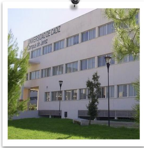
Facultad de Derecho