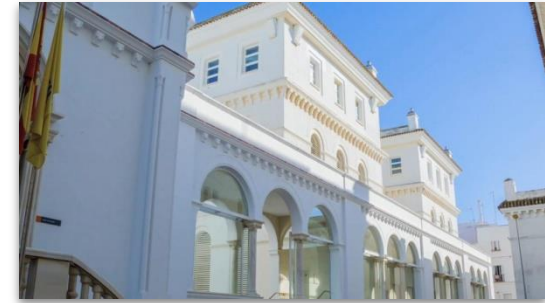
Facultad de Ciencias Económicas y Empresariales