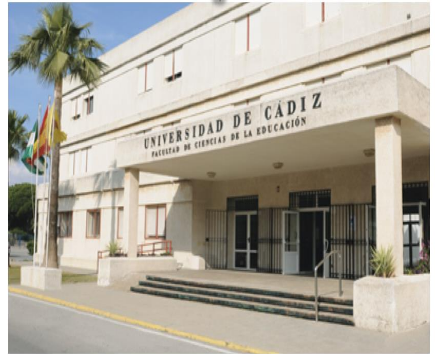
Facultad de Ciencias de la Educación